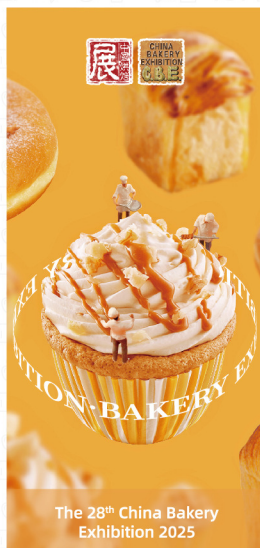
The 28th China Bakery Exhibition 2025