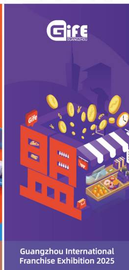
Guangzhou International Franchise Exhibition 2025