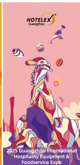
2025 Guangzhou International Hospitality Equipment & Foodservice Expo