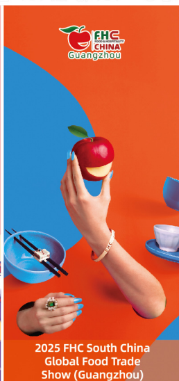
2025 FHC South China Global Food Trade Show (Guangzhou)