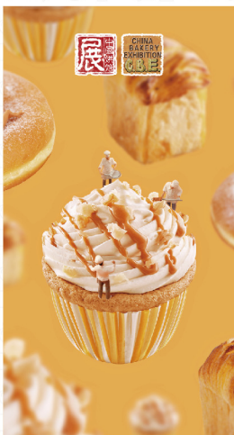
The 28 th China Bakery Exhibition 2025