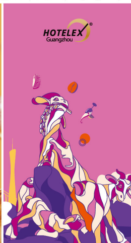
2025 Guangzhou International Hospitality Equipment & Foodservice Expo