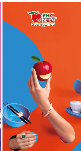
2025 FHC South China Global Food Trade Show (Guangzhou)